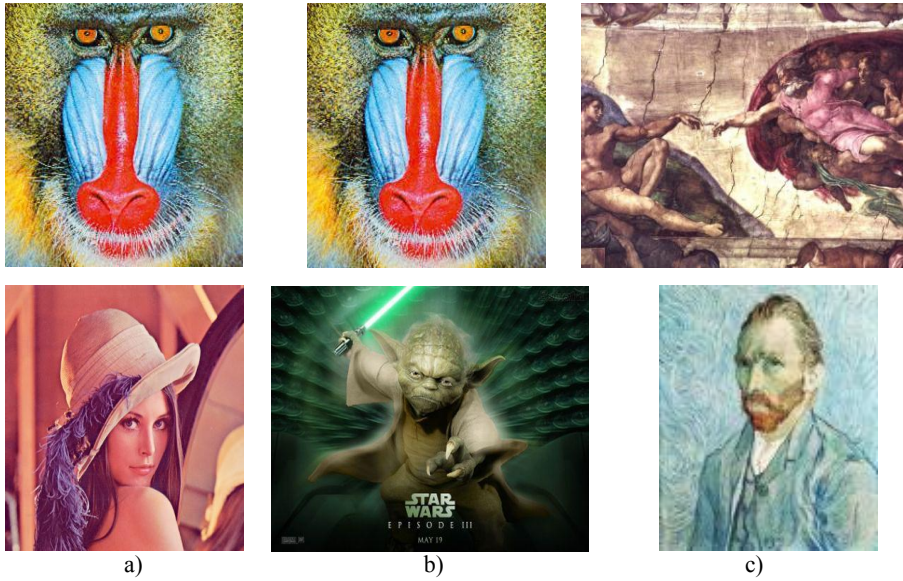
Fig. 2. Visual results for different tests by using our proposed method, the host and hide images are displayed from top to bottom a) column of test A, b) column of test B, and c) column of test C.

Figure 3 shows the visual results by using the method proposed in ref. [8] according with Table 1 and Figure 2. From the results presented in Table 1 and Figures 2 and 3,